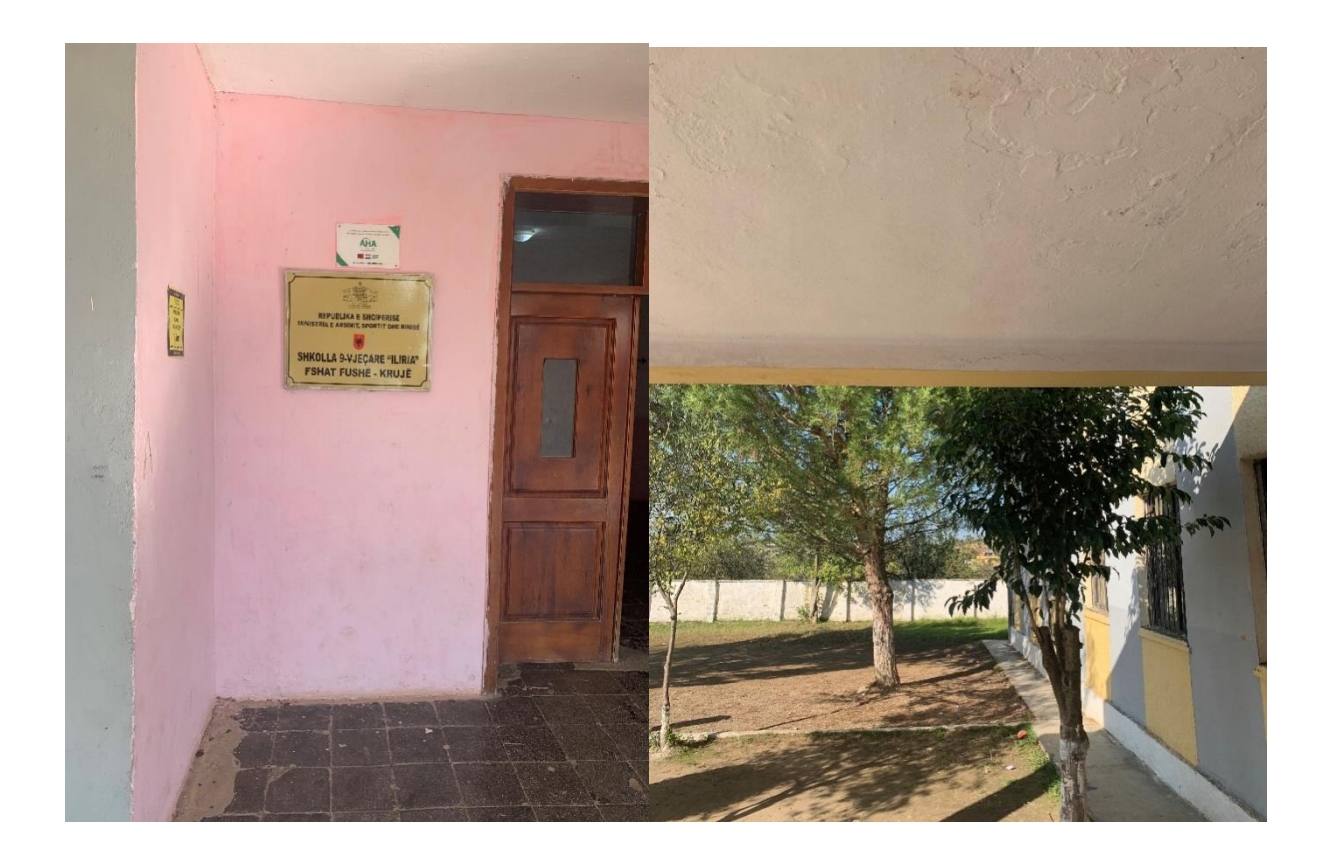
Annex 4 Existing Iliria 9-year school and Kindergarten pictures