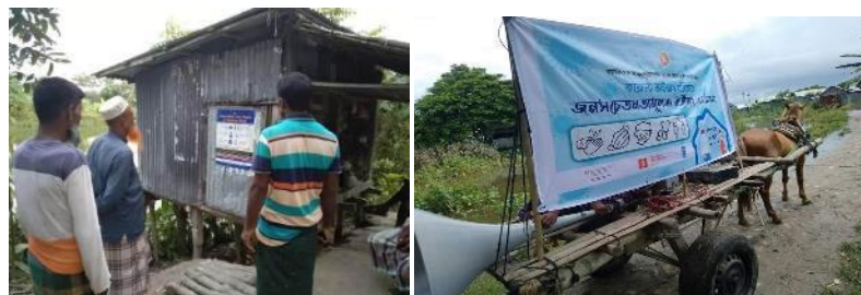
Photo 4: Awareness raising on COVID 19, VAW and human rights through loud miking (amplifying microphone) and poster

A total of 35,121 beneficiaries received various protective materials for COVID-19 response, i.e. mask, sanitizer, hand gloves, soap, etc. and among them, 7,771 beneficiaries received PPE, which enabled them to build their confidence to work as a front-line worker. Through loud miking (amplifying microphone), Facebook campaign, and appointed COVID 19 response focal points, EALG has helped to sensitize approximately 29,780 people on COVID 19, gender and human rights issues during this quarter.