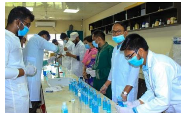
Photo 5: Hand sanitiser preparation at Pharmacy Department Laboratory of Khulna University

Frequent hand washing is mandatory to prevent coronavirus. Coastal districts like Khulna are badly affected by salinity and have a scarcity of water for handwashing. In a first-of-its-kind collaboration with the local administration and Khulna University's Pharmacy Department, the EALG project together with UNDP-LoGIC project and GoB-LGSP project has initiated the manufacture of hand sanitizers and distributed them for free to the government officials, the poor in the communities, and the village police who are the front-line COVID 19 fighters in Khulna. During this quarter, 6,000 bottles of 100ml hand sanitizer were produced and distributed among the Divisional Commissioner office, District Administration, Relief Control and Distribution center, Khulna Metropolitan Police (KMP), Circuit House, Police Super Circle, Press Information Department, KMP Traffic, Sonali Bank, Striking force Vehicle, 2 Pouroshva, 32 Third Gender, 9 UZP, 68 UP, Relief Volunteers, Civil Surgeon, Director Health, Khulna Medical Colleges Hospital, local communities, and village police.