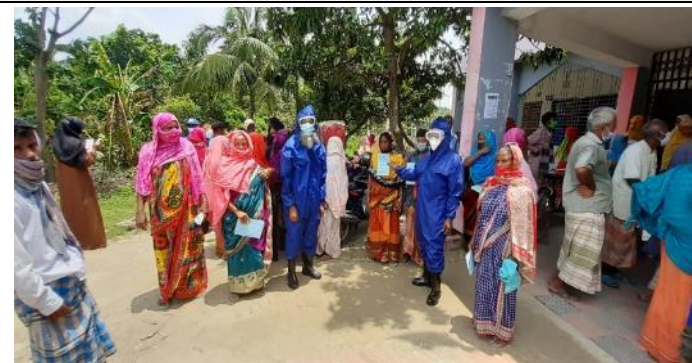
Photo 3: Village police wearing PPE and performing their duty while distributing VGF/VGD

EALG's COVID-19 response initiatives reduce the potential threat of infection, build confidence among stakeholders and help to engage them in COVID 19 response initiatives with support from the government and other stakeholders. The UP representatives, Secretary, Gram Police, community clinic members, Ward Committee members, and local residents have been benefited through the COVID 19 response initiatives.