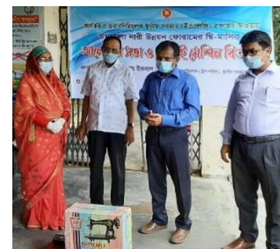
Photo 2: Sewing machine distribution by WDF among ultra-poor women

During the online launching event of COVID 19 preventive material distribution ceremony, Sudipto Mukerjee, Resident Representative of UNDP Bangladesh said, "Adapting to the times and meeting the needs of our beneficiaries is necessary during this pandemic, especially as we remain committed to leaving no one behind. Transparency is extremely important while doing that."