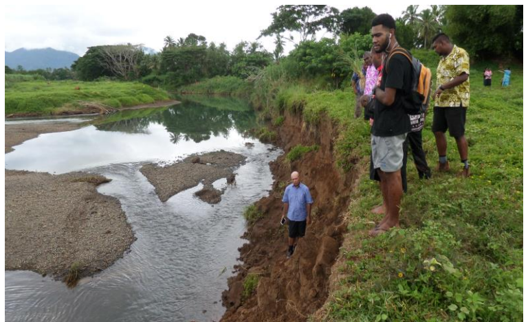
Figure 12-14: Participants at the site of the previous vetiver planting