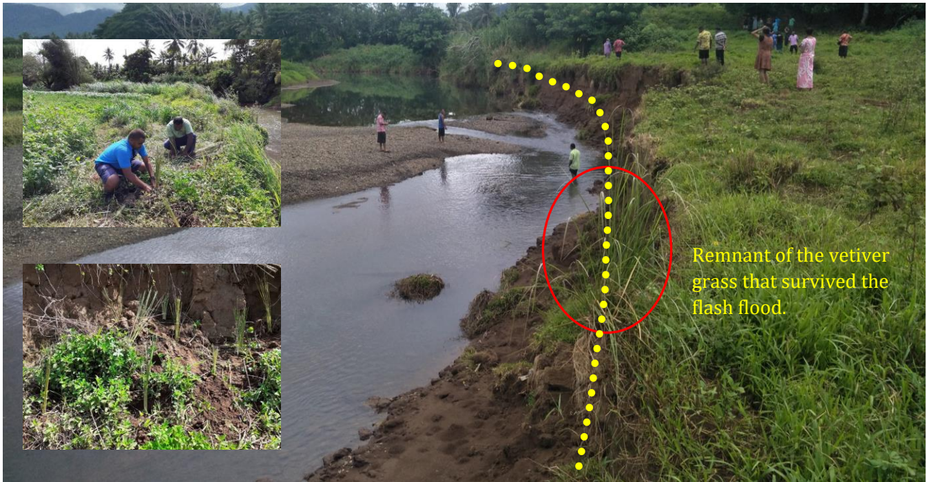
Figure SEQ Figure \* ARABIC 4: Bank slope where the first planting was done in 2019 (yellow dotted lines) and the community doing the planting (inset)