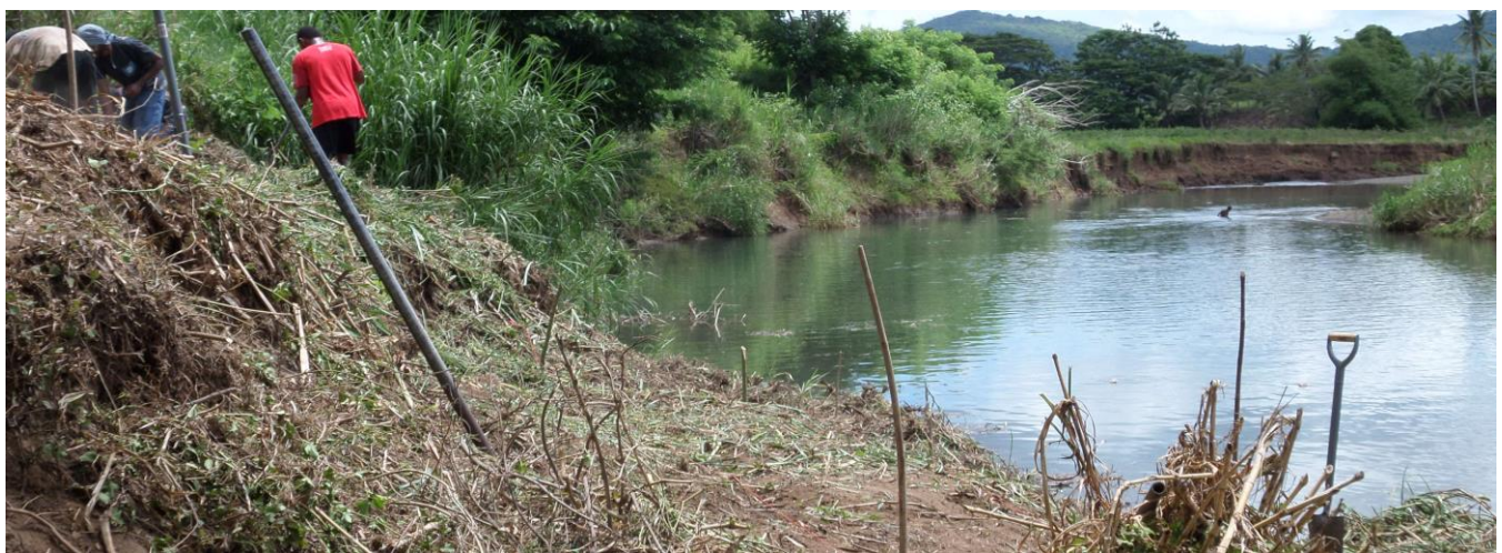
Figure 15-19: Site preparation of demonstration site by participants.