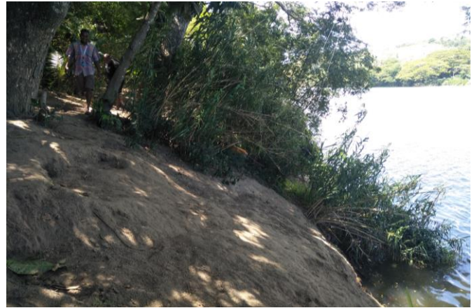
Figure 32-38: Random pictures of the identified sites proposed for stabilization.