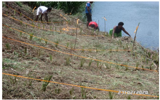
Figure 24 – 30: The planting of vetiver slips by the participants.