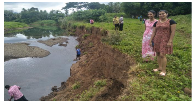
Figure SEQ Figure \* ARABIC 8-11: Participants inspecting the site along the Labasa river bank.