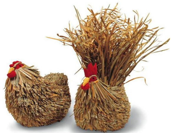
Figure 42 & 43: Handicrafts made from vetiver leaves and roots