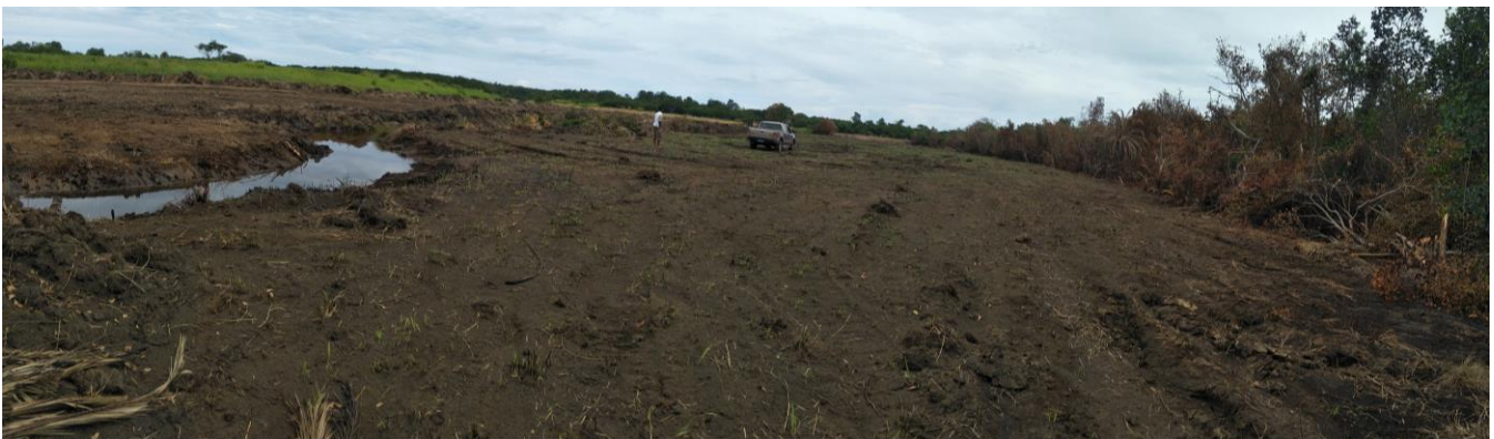
Figure 39-41: The new nursery site under preparation at Nadi