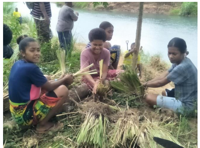
Figure 20 – 23: Preparation of the vetiver slips by participants for planting.

The planting of the Vetiver grass was done by all the participants as a hand on experience on the same day after the site preparation and the preparation of the vetiver slips.