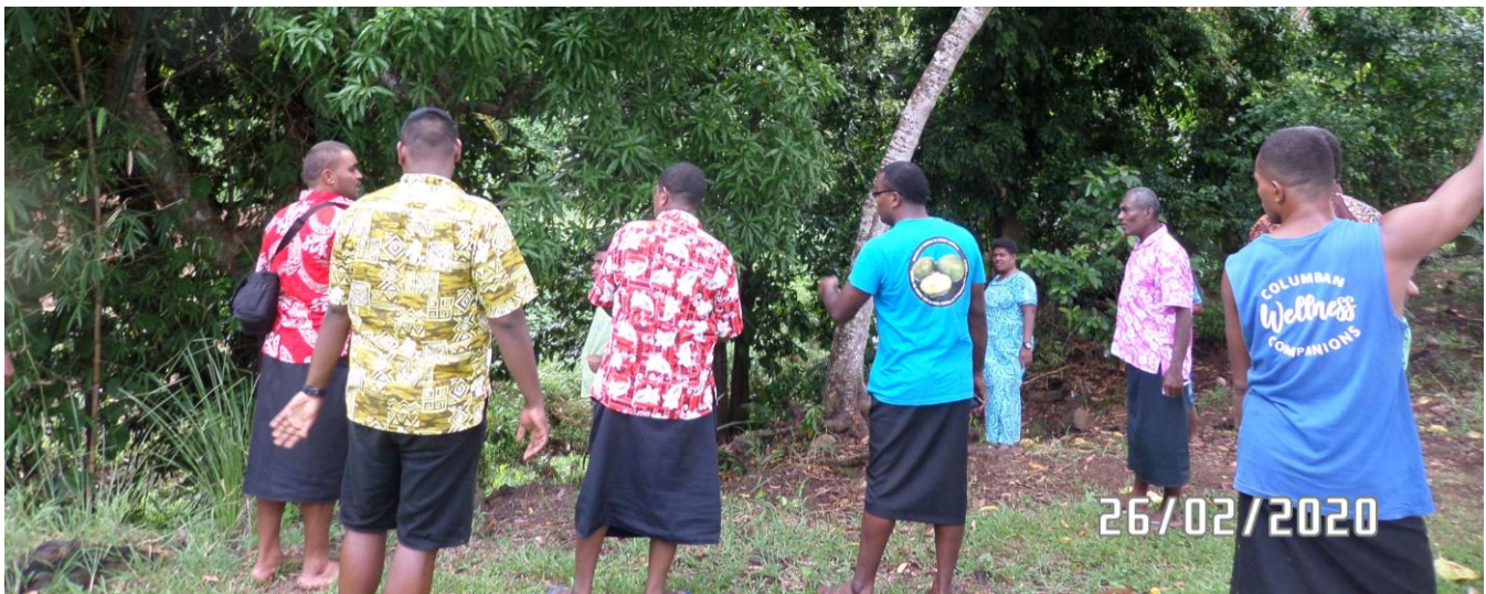
Figure SEQ Figure \* ARABIC 5: Inspection of the planting on the stream bank crest behind the village.

The site at the stream bank crest at the edge of the village, when visited had a few remnants of young vetiver plantings seeing growing in a patch. Other plants were shaded out by creepers and shrubs as no maintenance was done.