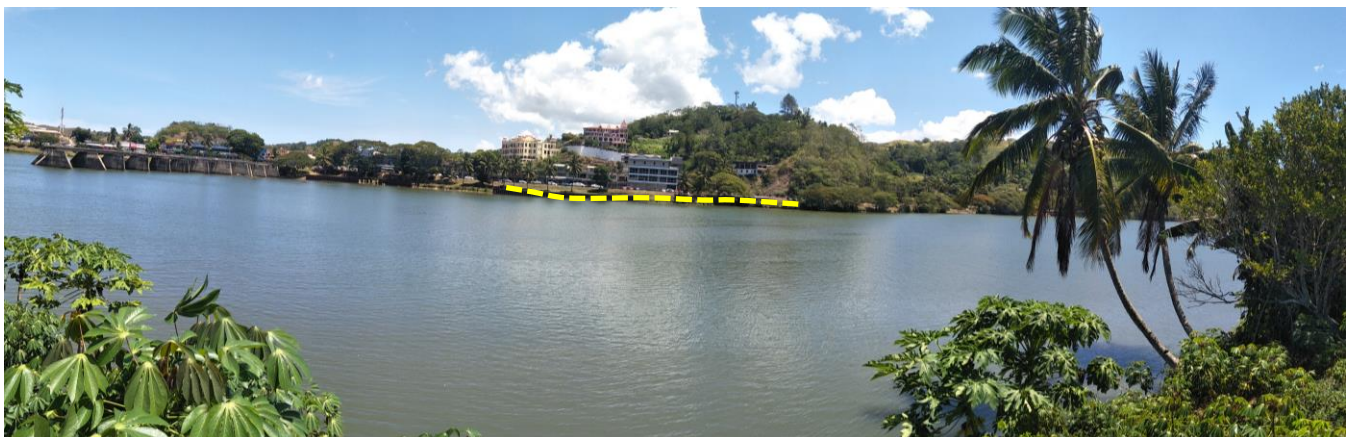
Figure 32: View of West Bank, one of the sites to be protected using Vetiver.

The East and the West banks of the riverbank were visited to ascertain the best method to use in the Ministry’s proposed bank stabilization project. The identified sites are prone to erosion and have been heavily eroded over time due to the flash floods.