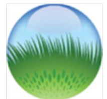
The Vetiver Network International