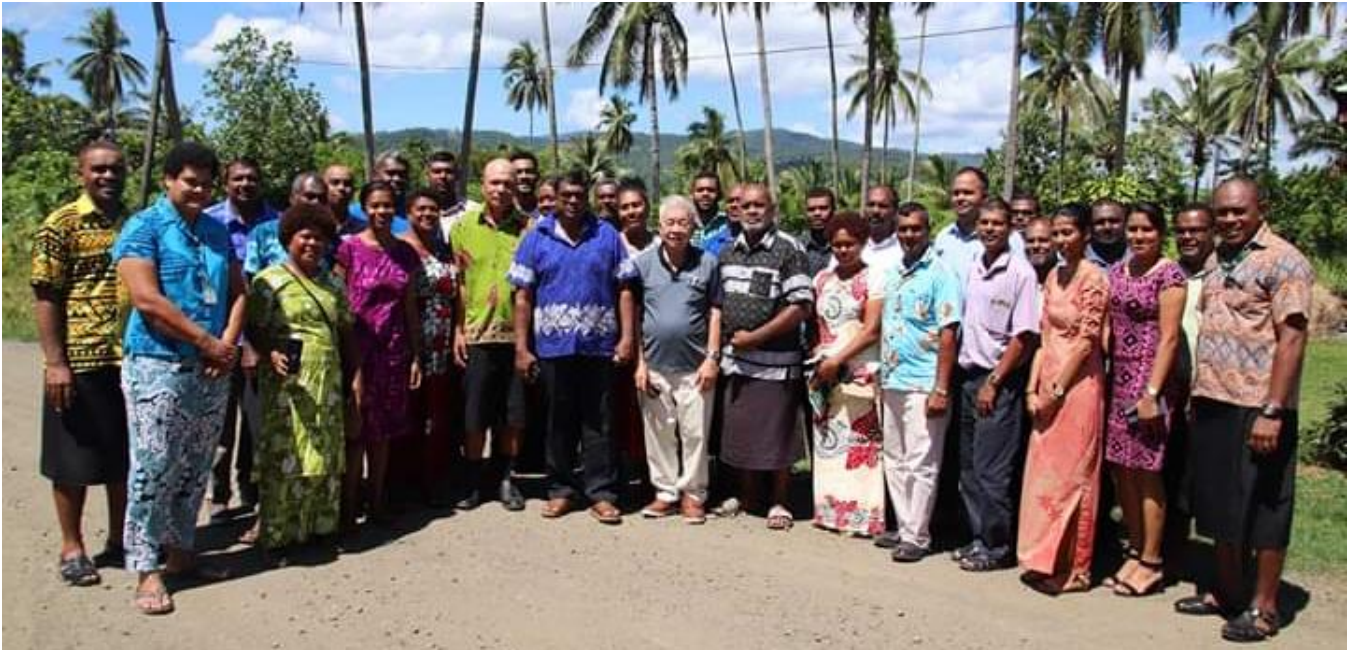
Figure SEQ Figure \* ARABIC 1: group photo of the participants with Hon Dr Mahendra Reddy.

A total of twenty two participants attended the three day workshop in Labasa. Refer annex 1 for listing of participants for the training workshop in Vunimoli village. Participants included both male and female representing each of the eight villages in the Labasa catchment.