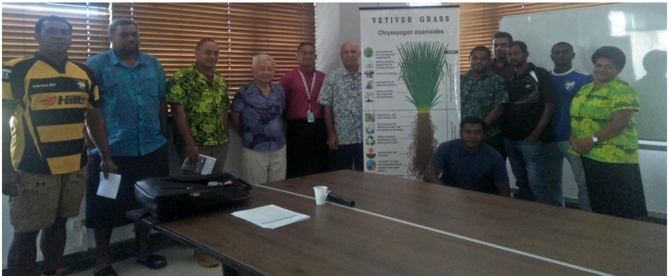
Figure 31: Group photo of the participants in Suva

Participants present, were representatives from the Ministry of Waterways and Environment, two each from Ministry of Forestry and Ministry of Agriculture. A total of ten (10) participants attended the one day training workshop (refer Annex 2).