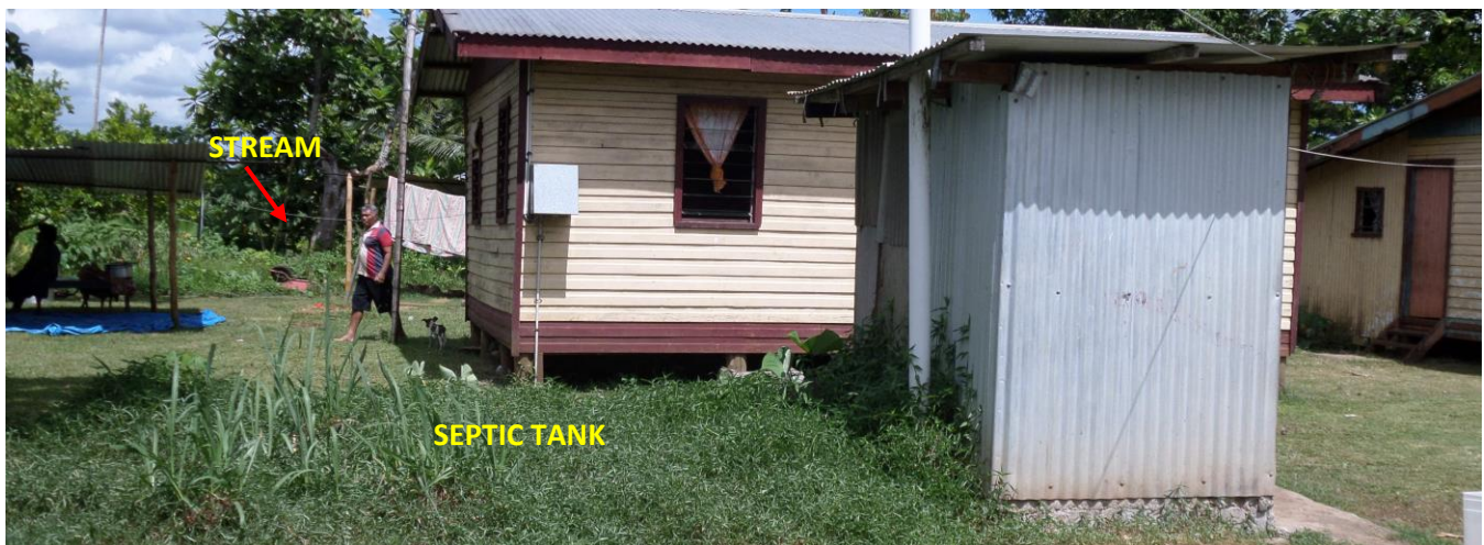
Figure 44: A toilet block at Vunimoli village