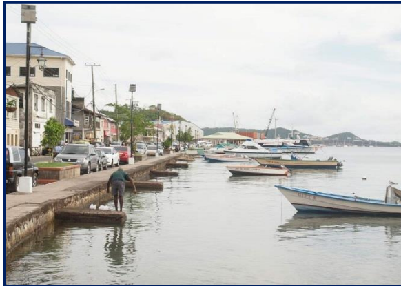
Carenage in St. Georges