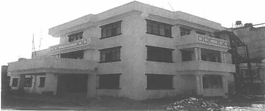
Figure 3: Electoral Education and Information Centre under Construction