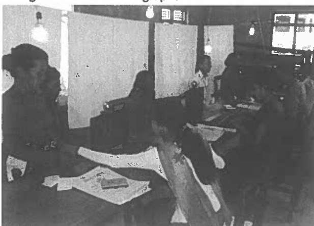
Figure 1: Voter Registration Programme in Nuwakot District of Mid-Western Development Region

The ESP continued to strengthen capacity of ECN to reach out and register eligible citizens on the voters list. The ECN's voter registration programme, which saw the inclusion of 8.5 million additional citizens in 2011, brought the total number of registered to 9.8 million. The project's focus has been on strengthening ECN's technical capacities to manage the voter registration in 75 districts