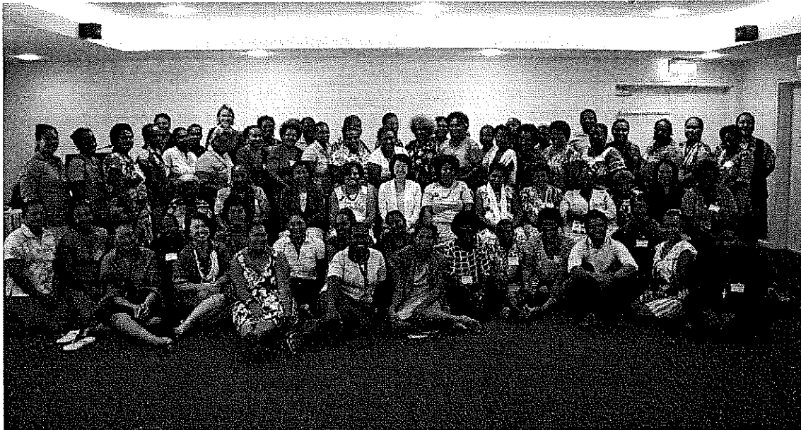
Participants at the National Women's Summit opening session

The three-day National Women's Summit brought women together from across the country for consultations on and endorsement of the draft National Action Plan on Women, Peace and Security; a dialogue on the RAMSI withdrawal; and the launch of a research report on "The Influence of Gender Attitudes and Norms on Voter Preferences in Solomon Islands". The Summit was coordinated by the Solomon Islands' Ministry of Women, Youth, Children and Family Affairs. The Summit was supported by the UN's Peacebuilding Project for Solomon Islands, administered by UNDP and UNWomen.