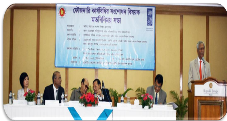
Distinguished guests at the National Consultation Workshop on the Proposed Amendment to the Code of Criminal Procedure