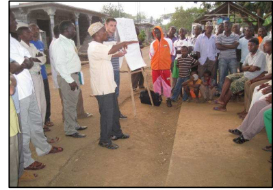
Figure 2: VRA Meeting in Wanani

In the four villages of Plateau de Djandro: The groups were representative of the different socio-economic groups of the community and their composition was gender sensitive. In Siry Ziroudani, the group was composed of 40 persons, including 15 old persons and 6 women; in Wanani the group was composed of 40 persons; in Mlabanda the group was composed of 37 persons including 15 women and 8 old persons; and in Nkangani the group was composed of 30 persons including 6 women and 4 old persons.