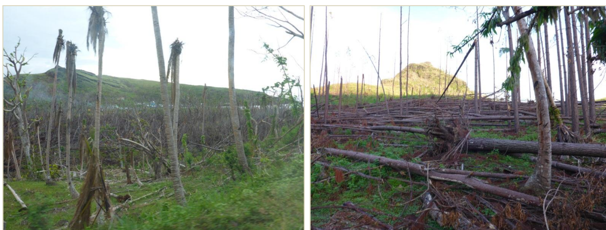
Figure 4 - Uprooted trees (left: Nayavutoka – right: Nabukadra)

The farming areas around the village were also severely impacted by the cyclone. The quantity of trees down due to the cyclone is large, and these commercial livelihood assets (Coconut trees / Mango trees / Lemon / Pines), will take a long time to recover. Pine plantations were particularly affected and in some areas almost 100 % of the trees are down.