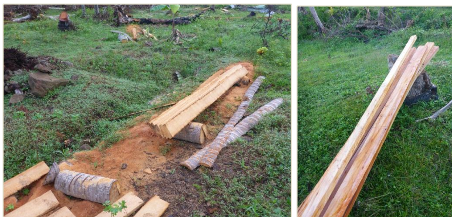
Figure 6- Logs being processed with chainsaw for construction of temporary shelters (Nabukadra village)