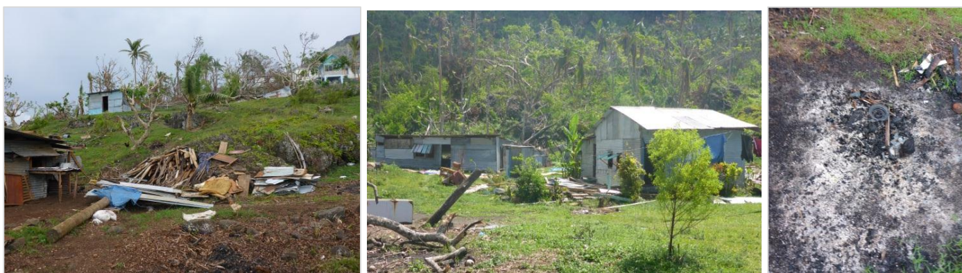
Figure 3 – Debris reused for temporary shelters (Nayavutoka and Nasau villages) / remains of burning of electronics

The remaining of the debris is often piled up or burned. During the discussions, the communities were made aware of the risk of burning the debris/waste for health (in particular plastic and electrical/electronic waste) and advised to avoid it, but they explained that there was a lack of alternative solutions (need to eliminate temporary storage of debris in the village).