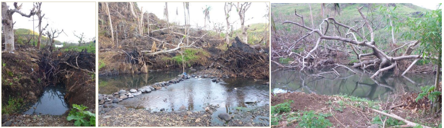
Figure 5 - Blocked irrigation system (Nayavutoka) – Stagnant water (Nabukadra)