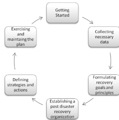
The Pre-planning process.

Recent experiences have shown that the limited effectiveness of recovery is generally due to a lack of leadership, planning, coordinated assessment, and effective management. Institutional constraints, gaps in communication, insufficient funding and limited access to capacity and knowledge can additionally undermine recovery effectiveness.