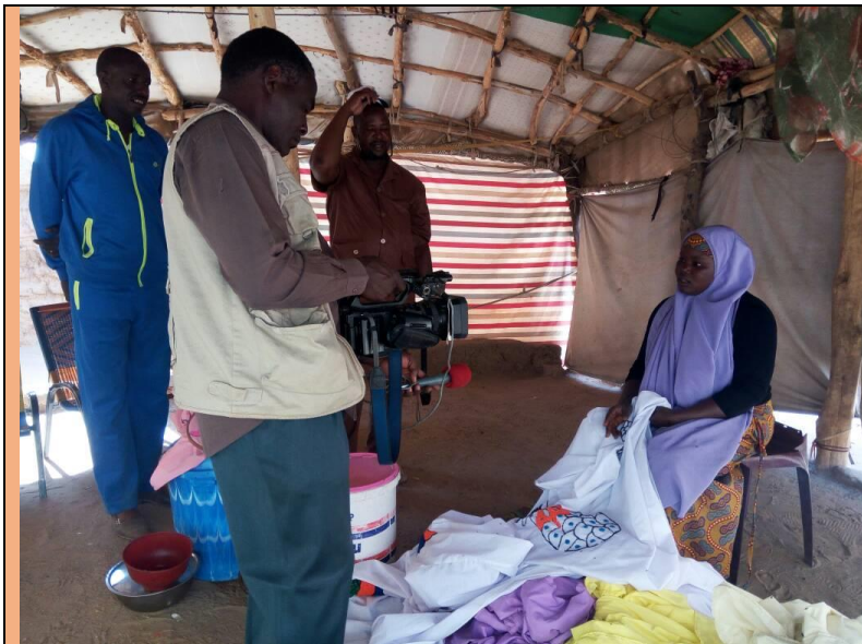
Figure 6: Ms; Sanda being interviewed by the project team

During field visits, beneficiaries have demonstrated great satisfaction for the support provided to them from the Government of Luxembourg. Meanwhile, the needs remain acute for socioeconomic and employment opportunity to reduce populations' vulnerability, and increase their resilience so they are better equipped to face daily challenges.