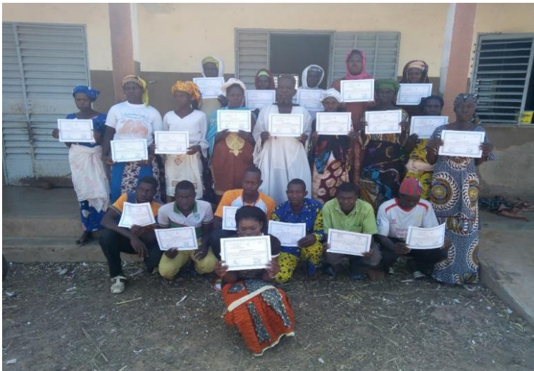
Figure 3: A group of trainees receiving their training certificates in poultry farming

Five hundred (500 of which 430 are young women) young promoters from the Boucle du Mouhoun (mid-West) and North regions were trained and equipped with local poultry farming skills and inputs and thus allowing them to integrate the local poultry sector. This income stream allows them to improve their livelihoods, and subsequently, the local economy. The trainings