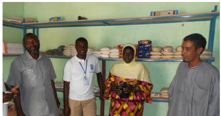
Figure 5: Aghaly benefitted from an Income Generating Activity of the project and he opened up his own shop