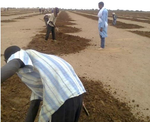
Figure 4: High Intensity Labor activities in Abalak; Young men trenching half-moons to fertilize the soil for farming and/or grazing

Although the relevance of the activities selected is satisfactory, their timing (seasonality) had to be taken into consideration in certain cases (see Challenges).