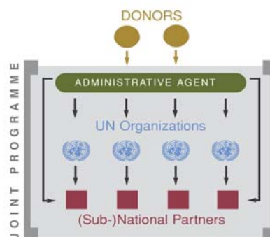
Graphic illustration of fund management for a Joint Programme with Pass-Through Funding

7.2 Both UNDP and UNCDF will be "Participating UN Organizations" in the Joint Programme. All management arrangements for these funding options are based on the United Nations Development Group Guidance on Joint Programming December 2003 7 . A visual representation of the pass through funding management option is shown below: